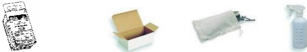
FIGURE 1 INNER CONTAINERS ARE NOT SUITABLE FOR SHIPMENT AS TRANSPORT PACKAGES